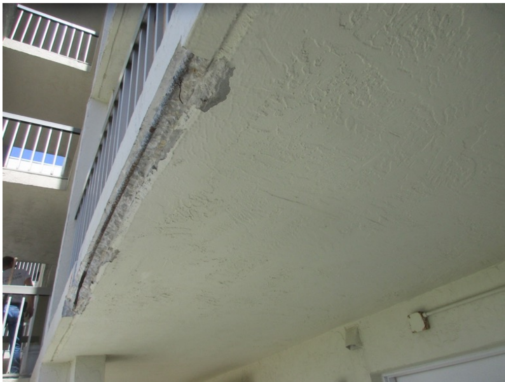
View of slab edge excavation in-progress outside Unit 113 on the walkway