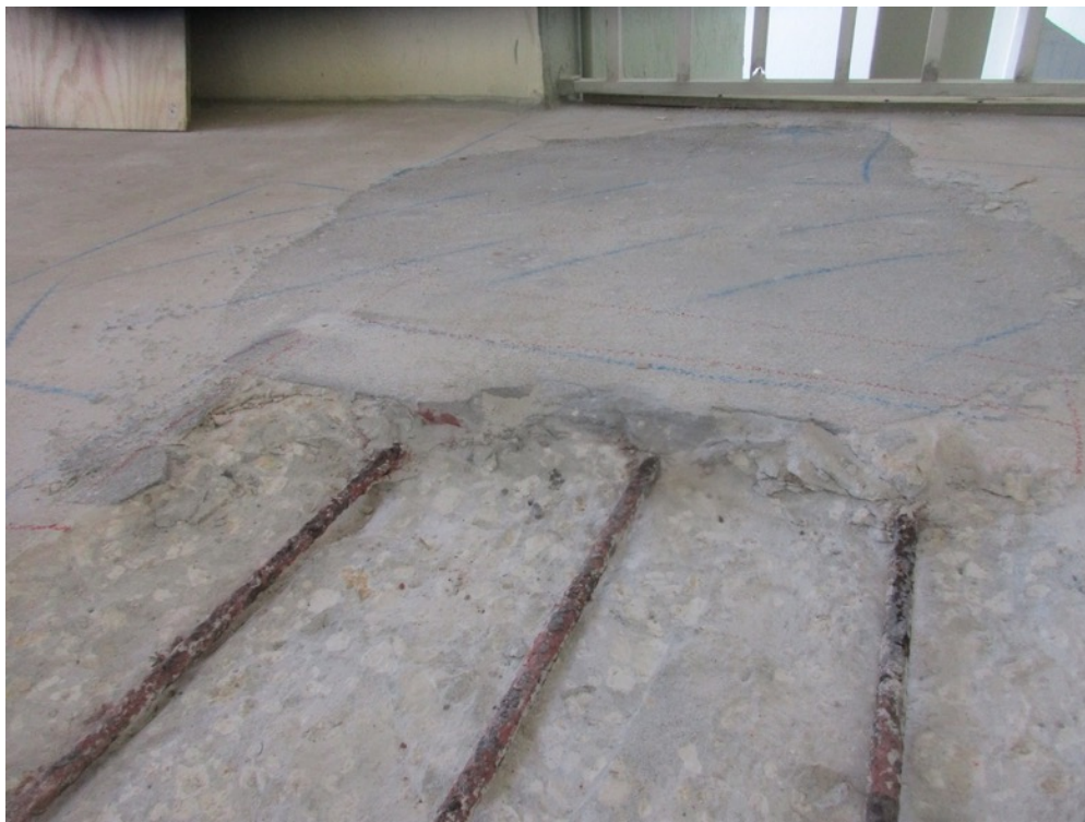
Close up view showing corroded reinforcing steel and additional spalling marked for repair on the walkway outside Unit 122