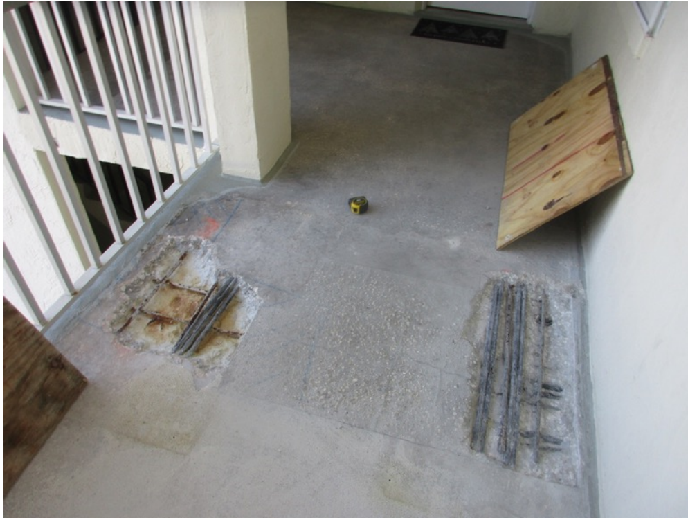
View surface excavation in-progress outside Unit 131 on the walkway