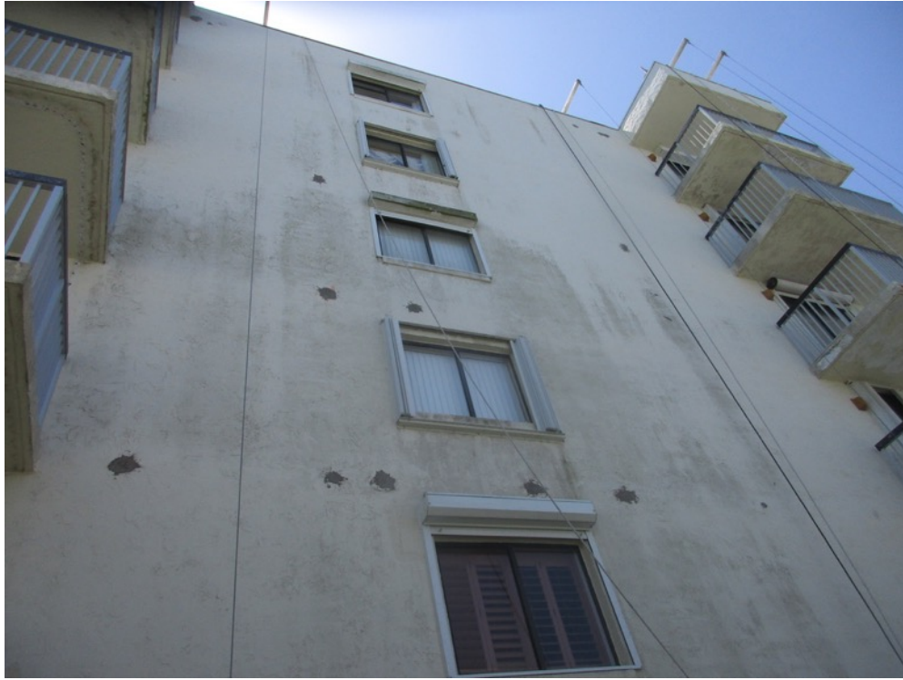
View of minor spot repairs completed on the north elevation shearwall