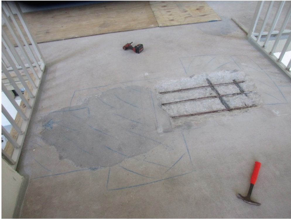
View of excavation in-progress outside Unit 122 on the walkway showing additional spalled areas marked for excavation