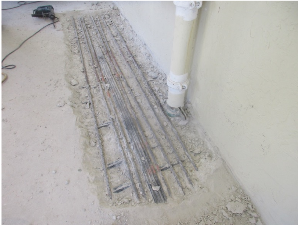
View of surface excavation in-progress between Units 122/123 on the walkway