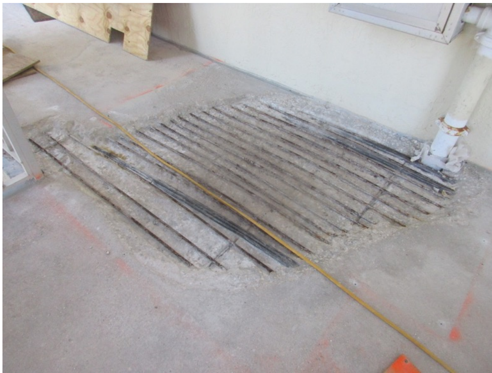
View of excavation in-progress between Units 132/133 on the walkway