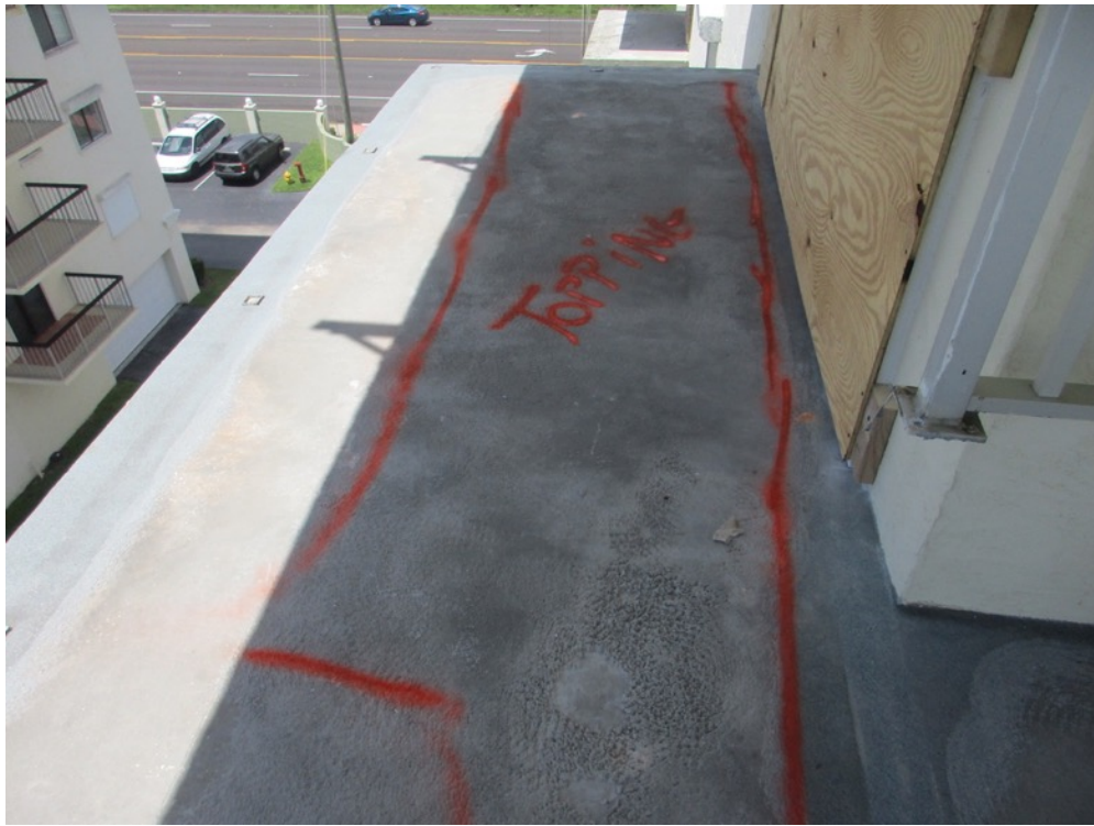
View of areas marked as likely topping repairs on the Unit 154 corner balcony south elevation