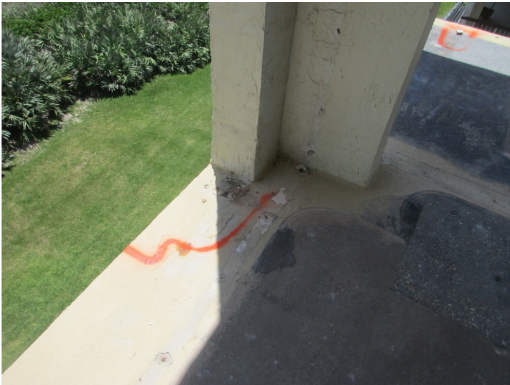
View of slab edge spall marked for repair on the Unit 134 corner balcony