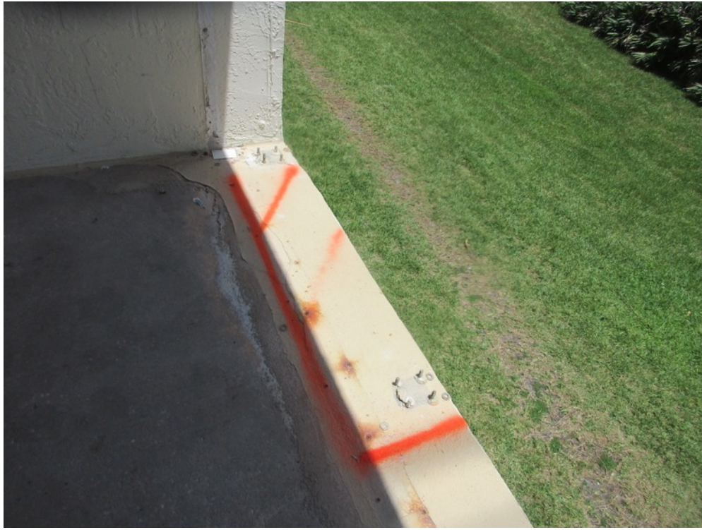
View of slab edge spall marked for repair on the Unit 114 corner balcony