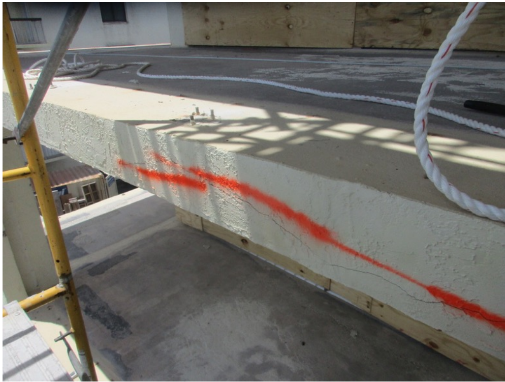
View of edge spall marked for repair on the Unit 134 balcony