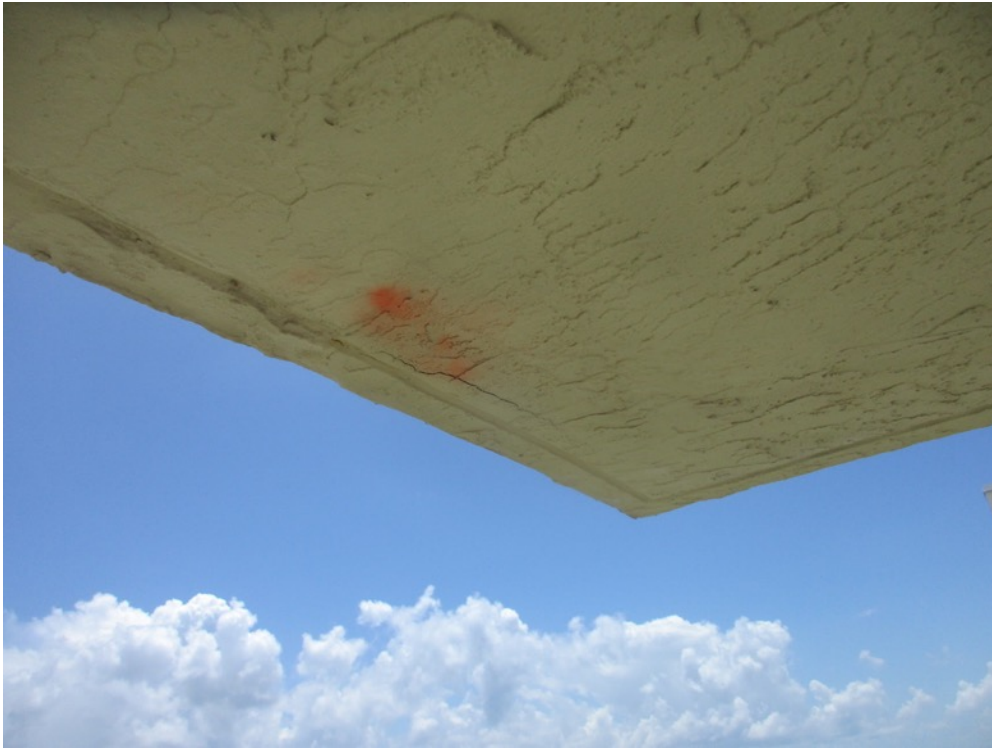
View of slab edge spall marked for repair on the Unit 144 corner balcony