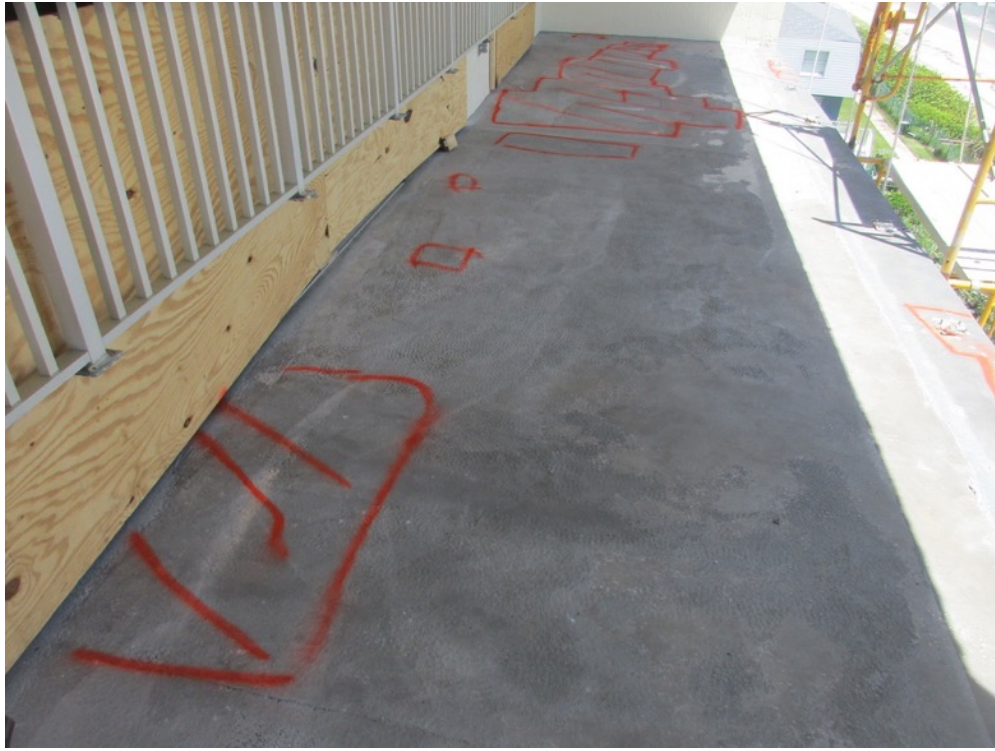
View of areas marked for repair on the Unit 154 corner balcony east elevation