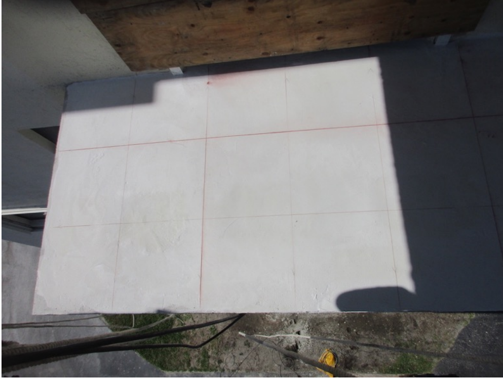
View of initial skim coat applied on the Unit 144 south side balcony